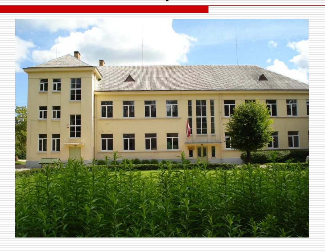
THE TOURISM ROUTE OF THE SCHOOL 2008